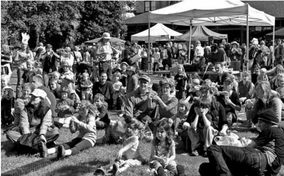
Thousands of people enjoyed the annual Seattle Tilth Harvest Fair on September 11. See more photos and thank yous on page 4. Photo by Jake Watrous