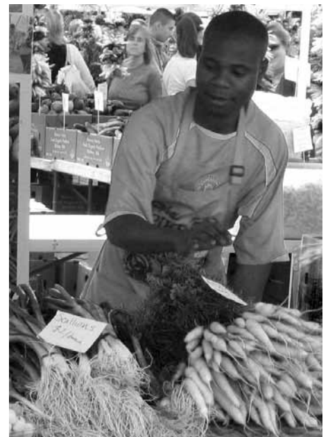
A Burst farmer sells produce at the Harvest Fair.

We are launching a campaign to recruit 1,000 donors before the end of 2010. Whether you can give $1 or $1,000, your donation makes a difference and keeps these programs