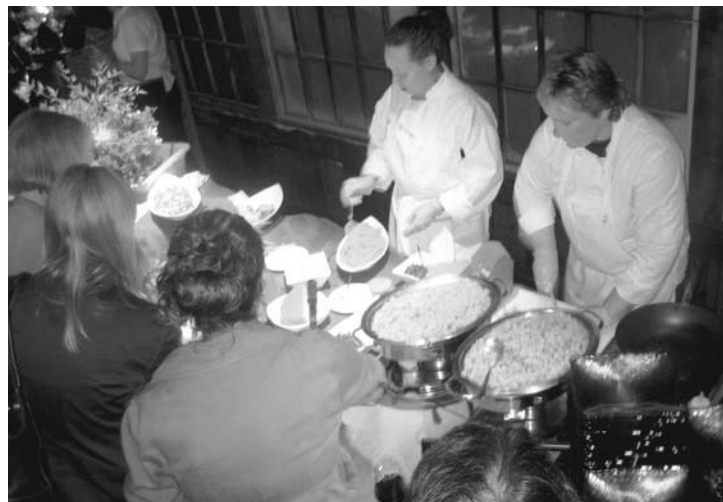
Herban Feast chefs created a fresh meal on-the-spot with produce from our generous local farmers.