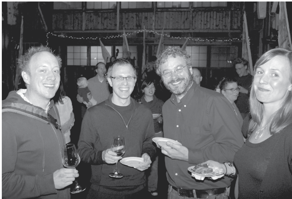
More than 200 Seattle Tilth supporters tasted and toasted - and a few even twirled - at our fundraising event Nov. 12. See article on p. 5.