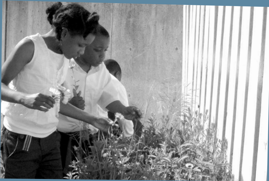
Children pick flowers at our Teaching Peace Through Gardening program with the Atlantic Street Center.