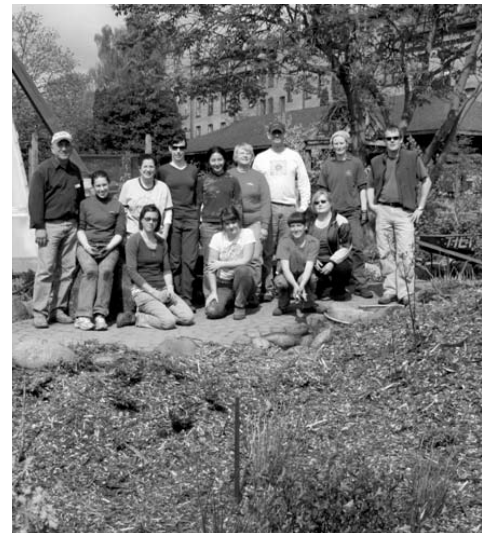
In April, volunteers gathered to celebrate the installation of our new rain garden across from the greenhouse in our Wallingford Demonstration Garden. Partners in the project were Stewardship Partners and the WSU Native Plant Salvage Project.